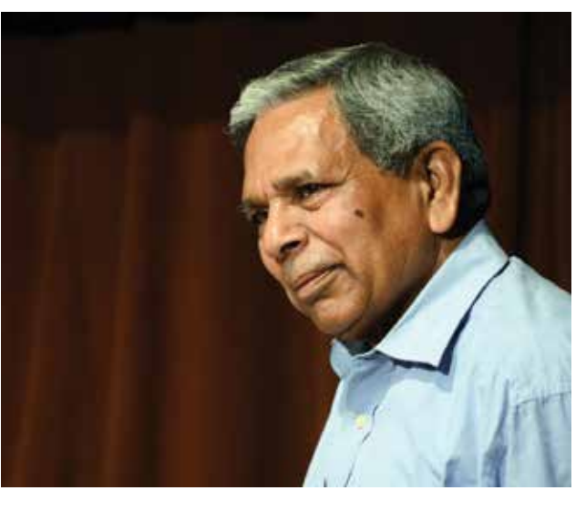
Come forward, together let us complete this spiritual journey ...